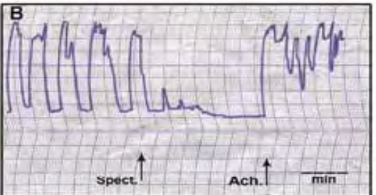
Figure 1 (B): Site of action of spectinomycin (Spect.) on isolated rat's uterus during early pregnant stage. 160 \mu g/ml bath of spectinomycin (Spect.) followed by 0.25 \mu g/ml bath of acetylcholine (Ach.).